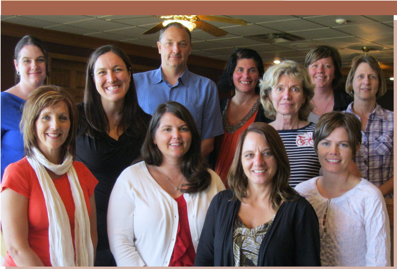
SDASP board members present at August meeting in Chamberlain